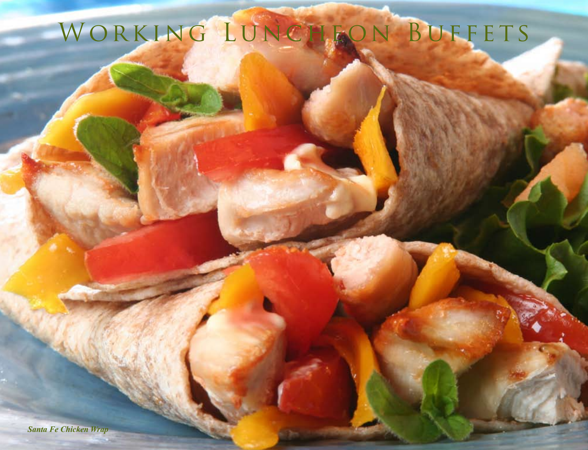
Santa Fe Chicken Wrap