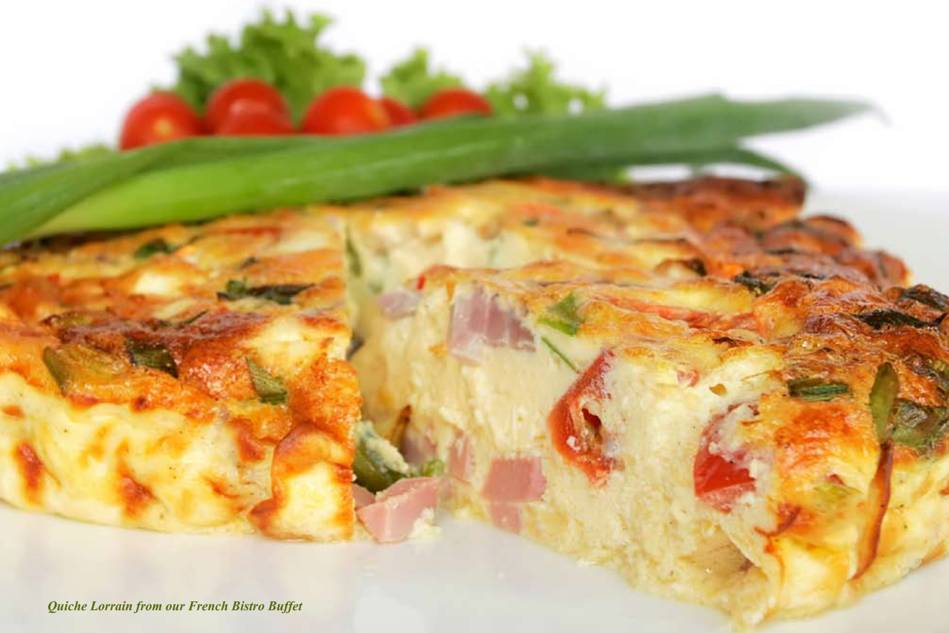
Quiche Lorraine from our French Bistro Buffet