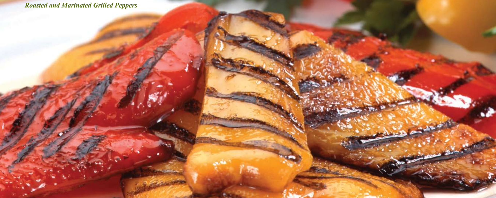
Roasted and Marinated Grilled Peppers