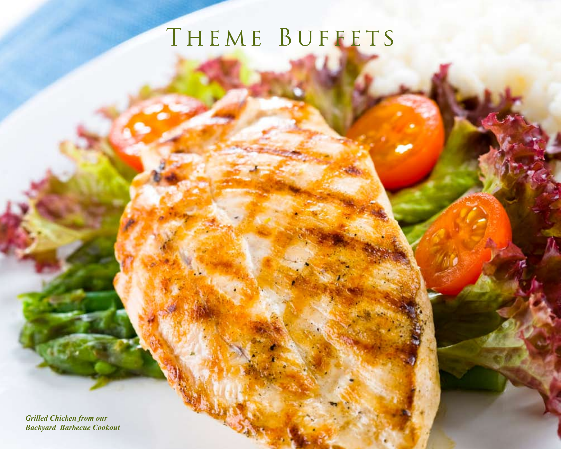
Grilled Chicken from our Backyard Barbecue Cookout