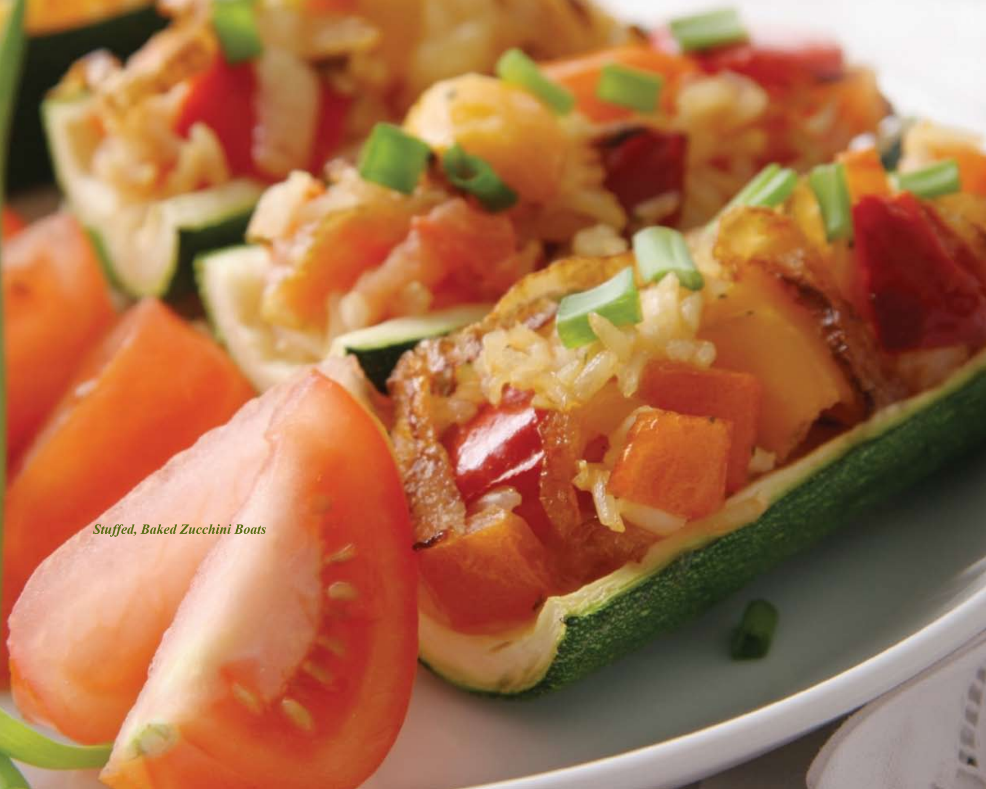
Stuffed, Baked Zucchini Boats